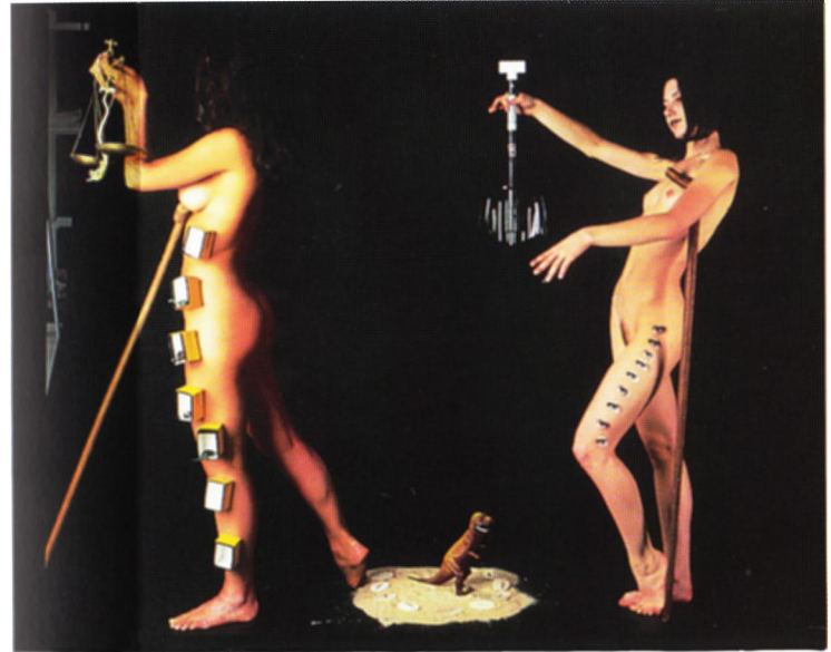
Peter Hartman The Cult of Copying 1994 30" x 40"

of the hard iron in Man Ray's Gift (1921) by a soft breast in In Defense of Feminism and buttocks in The Rear Guard Confronts The Avant Garde , indicate.) Thus their works have an analytic edge—cut to the quick of preconceptions, dismembering them in the very act of rendering them, reducing them to "mock ups" in the very act of making them self-evident. In this, they are as subversive as they are "conservative." As such, they have achieved that unusual thing, a postmodern balance of power.