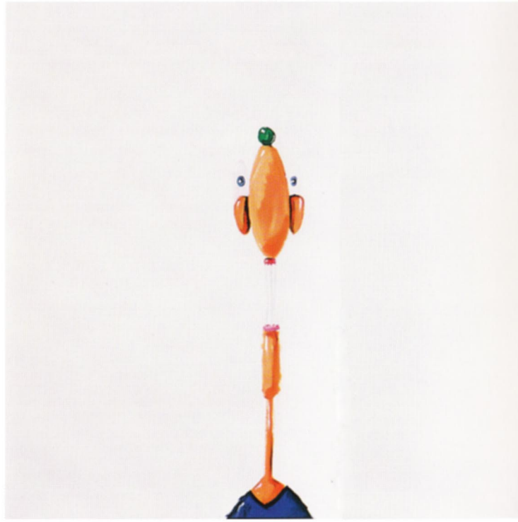
George Condo Stepmonk's Diary 1996 80" x 80"