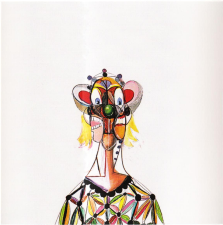
George Condo Raging Schizo at the Gate 1996 80" x 80"