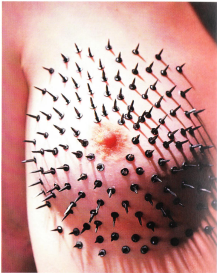
Peter Hartman In Defense of Feminism 1993 30" x 40"

become talk show chic. Their works are informed by a rage increasingly rare in art—a measured, visionary rage far from the shrill, self-blinding rage of would-be activist art. Condo's crazy clowns and Hartman's bitch goddesses are masterpieces of demystification-desublimations of what has always been regarded as