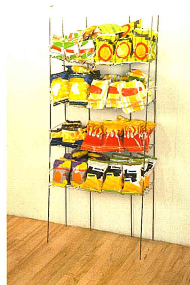
Kevin Landers Untitled (Chips and Chip Rack) 1996 5' x 3' x 1' wire, tape, styrofoam

tional cafeteria, a pattern of empty lemonade containers can be discerned through a pile of transparent garbage bags tumbling down the front of the picture plane.