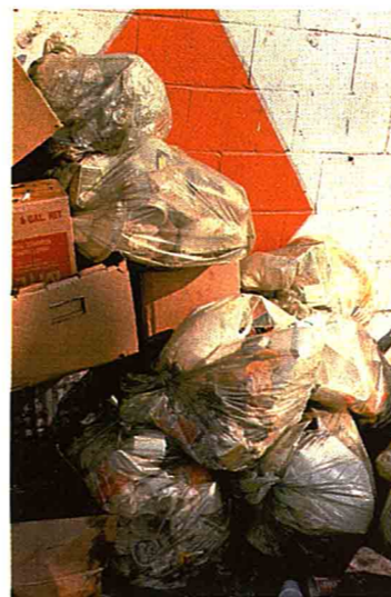
William Eggleston Untitled (Troubled Water series) n.d. 20" x 16" dye transfer print

quieted versions of the original. There are precedents: Stuart Davis' "Odol," the way Fairfield Porter paints a milk carton, Johns' painted bronze ale cans portraying the humbling process of time. What might be called the aesthetic equivalent of Christian love is at work here.