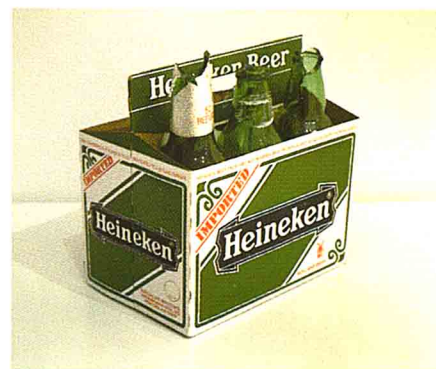
Curtis Mitchell Untitled 1990 10" x 9" x 6" beer bottles, carton

Curtis Mitchell's work accelerates the natural destruction of manufactured objects. Though most of his work flip-flops between the threatening and the comic, as if made by an angry clown, this is an uncharacteristically gentle six-pack of broken beer bottles (two Becks, two Heineken, two Rolling Rocks). By sequentially arranging the bottles, Mitchell references minimalist serialism. This miniature architecture of refuse transmits a literally busted self-containment, refusing to access meaning beyond the unusual consoling act of placing worthless broken bottles back into a beer carton, to protect them from further harm.