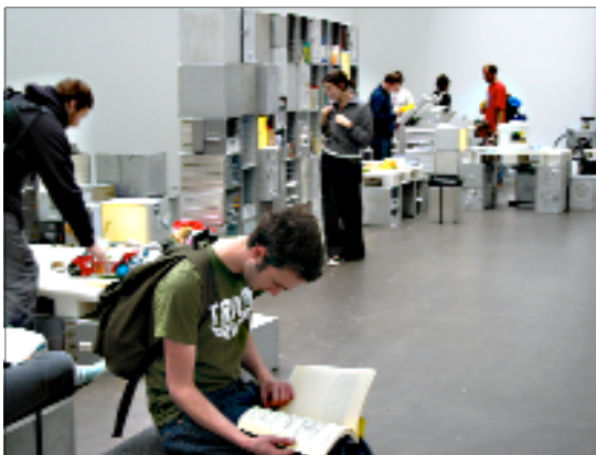
N55, SHOP , 2002, mixed media installation